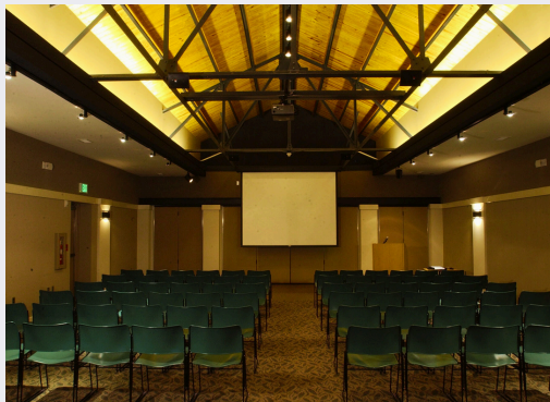
LOW COUNTRY CENTER